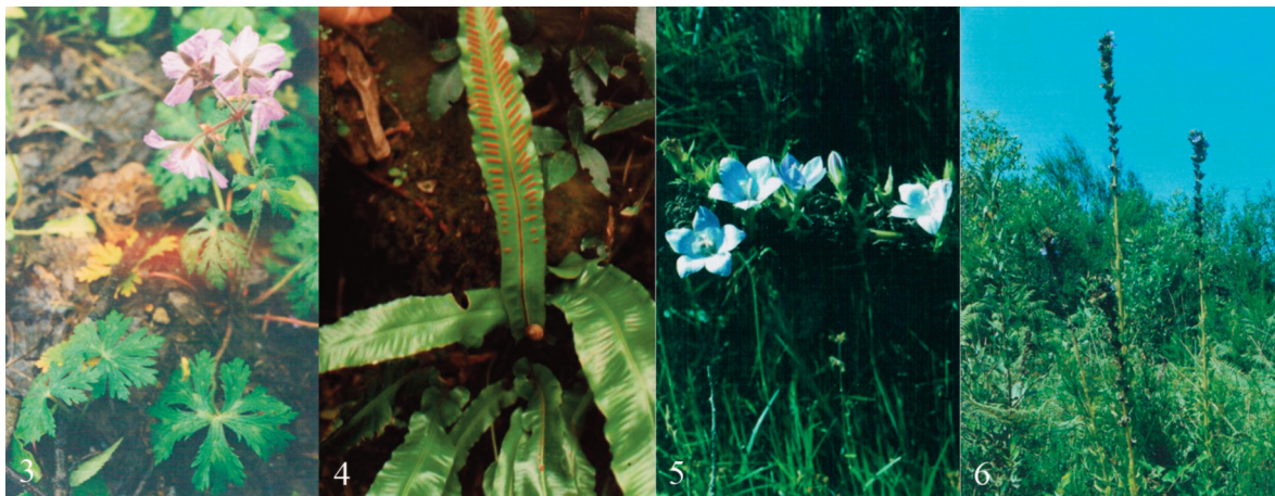
Figure 3. Geranium atlanticum B.R., endemic of N-Africa. Figure 4. Scolopendrium vulgare Sm., very rare species. Figures 5, 6. Campanula alata Desf., endemic of Algeria-Tunisia, Red List-IUCN.

mammals, insects, reptiles, Amphibians, birds and fish. We counted up to 706 animal species including the zooplankton (Table 3). The National Park of El-Kala is one of the last refuges for the stag endemic to Algeria and Tunisia. Forty years ago, there were more than 300 individuals. This number fell considerably because of the hunting and the forest fires. Currently, its number does not reach 30 individuals; maybe less. Several animal species are endemic to the region, others are more widely distributed, but they do not live any more in the area. The faunistic list can change at any moment seen the importance of the zone for its surface and ecology (Figs. 7–9).