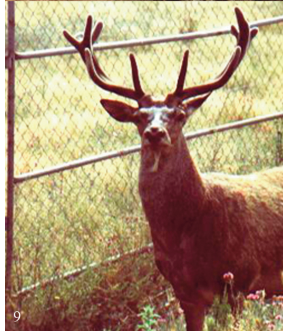
Figure 7. Delicious Lactaire; possibility of potential significant culture. Figure 8. Exploitation of light for drying of the cork. Figure 9. The Barbary stag in semi captivity.

habitants of the park but also can contribute to in the economic development of country. The knowledge of faunistic and floristic diversity and of the distribution methods of the fauna and flora of a territory,