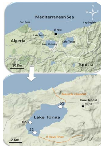
Figure 1. Map of the study area, with locations of sampling stations.

We have chosen three stations in ways to meet the requirements