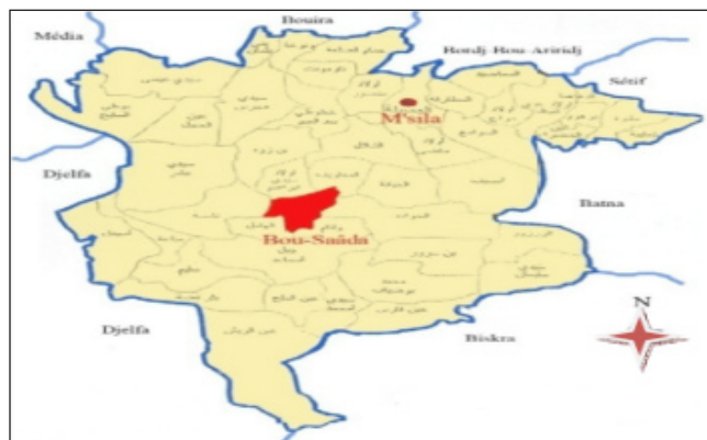
Map 2. location of the city of Bou-ssaada in M'sila