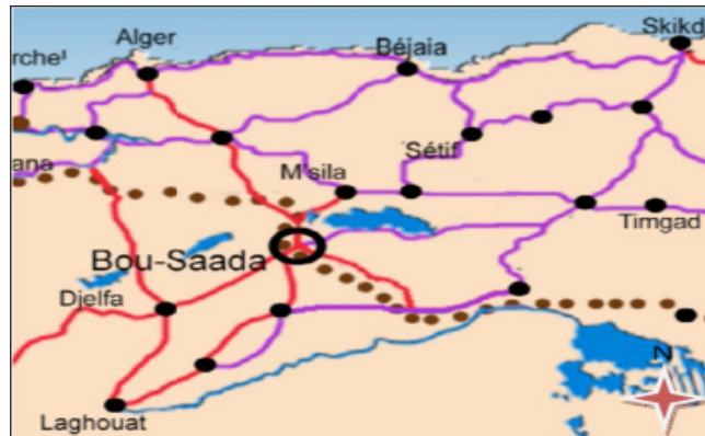
Map 1. location of the city of Bou-saada in Algéria

natural, cultural and historical characteristics [4-5], and to the southwest of the capital of the East, Constantine, 320 km away. M'sila which is 65 km away. It is bordered to the north by the municipality of OuledSidi Ibrahim, to the northwest by the municipality of El Hawamed, to the west by the municipality of Tamesa and to the south by BordjWaltam, and where important national roads meet. The desert. The average height of the city above sea level is 560 m, and the city is located at the northern foot of the Saharan Atlas represented by the Awlad Neil Mountains, which are the mountainous borders of the high plains and overlooking Shatt El-Hodnain precipitation.