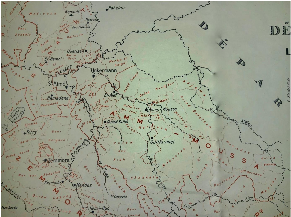
Figure 1: Location of the Municipality of Ammi moussa Source: the municipality service of Ammi Moussa.2022.